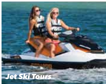
Jet Ski Tours