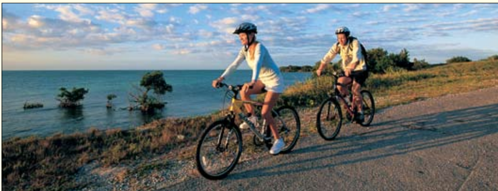
BIKING IN THE LOWER KEYS

A Singh Resorts luxury beachfront resort, comprised of 87 two & three bedroom two story suites located on a 2.5 acre private sandy beach overlooking the Gulf of Mexico offers guests the best of both worlds; the comforts and conveniences of home combined with resort amenities. Each suite boasts two and one half baths, gourmet kitchens, open floor plans, 42" plasma TVs, Hi speed internet, WI-FI, DVD/CD stereo system, waterfront decks and limited edition artwork. The resort features a tropical lagoon pool, watersports and watercraft rentals, spa services, fitness center, signature restaurant (The Butterfly Cafe) and beachfront Tiki Bar (TJ's Tiki Bar). Tranquility Bay is a spectacular and unique destination for corporate meetings, executive retreats, incentive programs, destination weddings and family reunions offering over 2500 square feet of flexible meeting space in addition to exciting outdoor venues with panoramic water views.