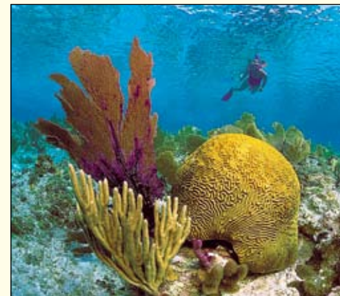
FLORIDA KEYS NATIONAL MARINE SANCTUARY

Description: Situating on the only Caribbean island in the United States, The Reach boasts Key West's only natural beach as our backyard. Offers the perfect blend of glistening white sand and breathtaking sunshine. Pamper yourself at this enchanting hotel, complete with 150 elegant guest rooms, sweeping beach views, and attentive guest services. Unwind on your private balcony, as soothing ocean breezes caress you. Relax poolside and enjoy a hearty breakfast from your comfortable chaise lounge. Discover warm hospitality within a true landmark setting.