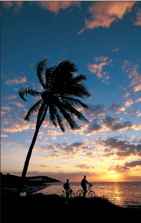
BAHIA HONDA RAIL BRIDGE

Cay Clubs newest luxury beachfront resort, comprised of 87 two & three bedroom two story beach houses located on a 2.5 acre private sandy beach overlooking the Gulf of Mexico offers guests the best of both worlds; the comforts and conveniences of home combined with resort amenities. Each beach house boasts two and one half baths, gourmet kitchens, open floor plans, 42" plasma TVs, Hi speed internet, WI-FI, DVD/CD stereo system, waterfront decks and limited edition artwork. The resort features a tropical lagoon pool, watersports and watercraft rentals, fishing charters, eco-kayak tours, sunset cruises, spa services, fitness center, signature restaurant and beachfront Tiki Bar. Tranquility Bay is a spectacular and unique destination for corporate meetings, executive retreats, incentive programs, destination weddings and family reunions offering over 2500 square feet of flexible meeting space in addition to exciting outdoor venues with panoramic waterviews.