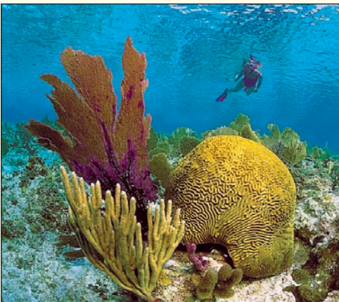
FLORIDA KEYS NATIONAL MARINE SANCTUARY

Hyatt Key West Resort & Marina, fresh from a $10 million dollar renovation, welcomes guests to this 118-room "oasis off Duval Street". The hotel features a new "spa chic" look and tropical modern feel throughout. The property offers a full-service restaurant, the Blue Mojito Pool Bar and Grill, Room Service, a renovated pool, three cabanas, the Jala Spa, health club and nightly dinner cruises from the hotel's dock. The hotel has three meeting rooms, including the Marquesa Room - a second-story, 1,141-square foot room that features a wrap-around outdoor terrace with a stunning view of the Gulf of Mexico. The Tortuga Room, a 780 square-foot meeting room, and the Harbor Board Room with an outdoor veranda overlooking the water. A number of outdoor locations, including the Nicola Beach and the Dock, are available for group receptions and dinners.